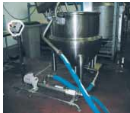
Start-up box for ketchup and mayonnaise sauce transfer.