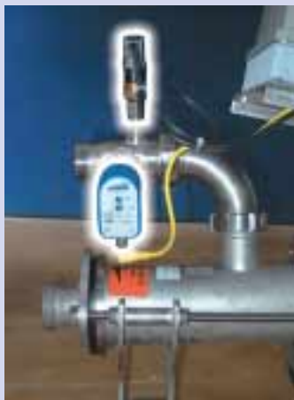
Dry running protection device in wine filtration application.