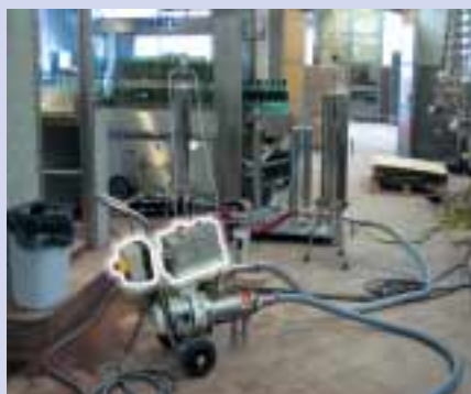
Set of accessories for wine filtration.