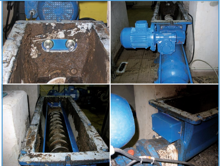
PCM's new innovation